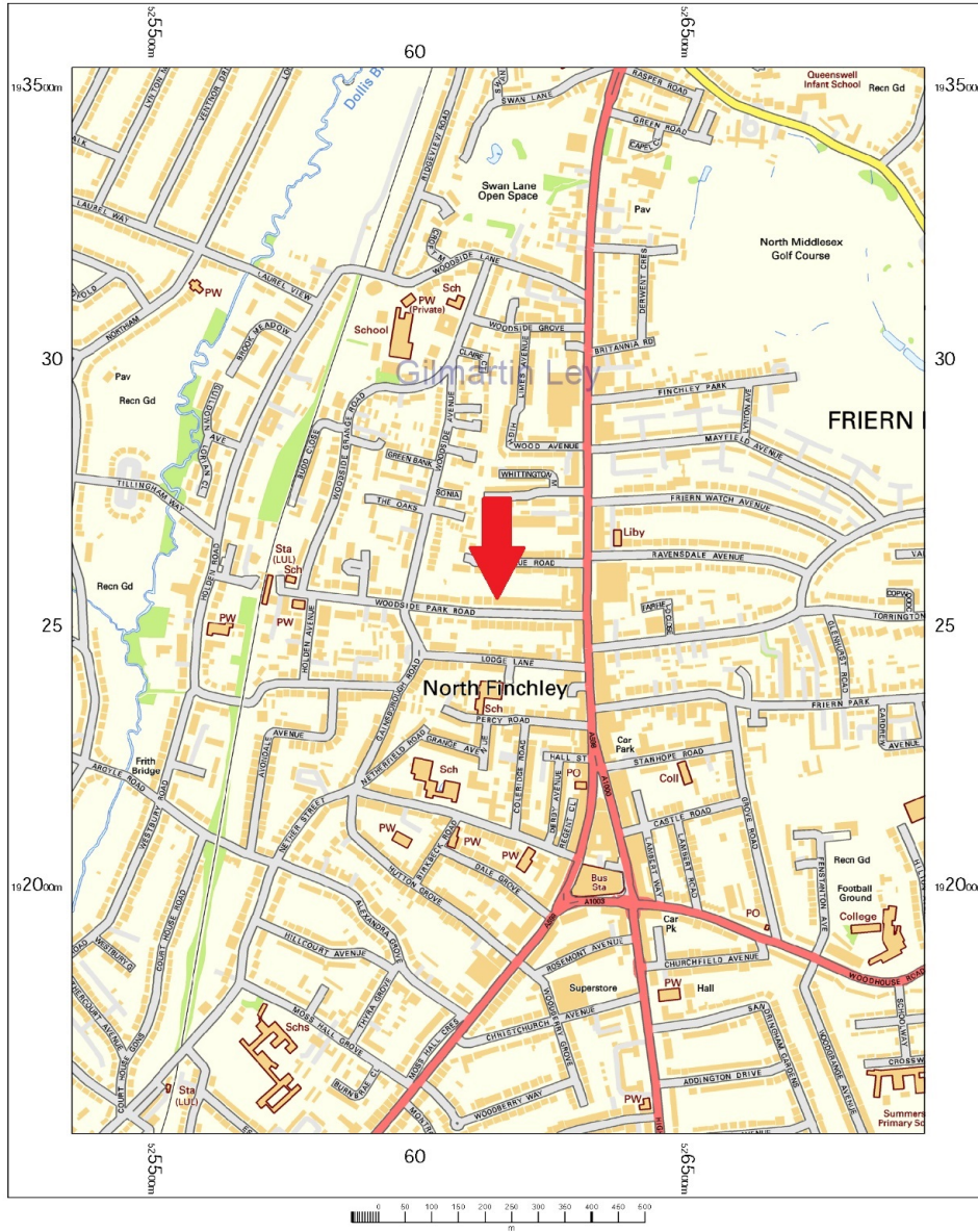
Catherine Lodge, London N12 8RP

OS Streetview Wednesday, May 7, 2025. ID: CM-01221118 www.centremapslive.co.uk