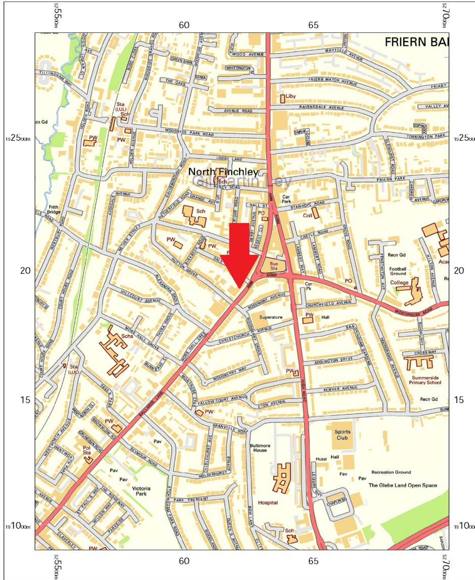
Global House, Finchley N12 8NP