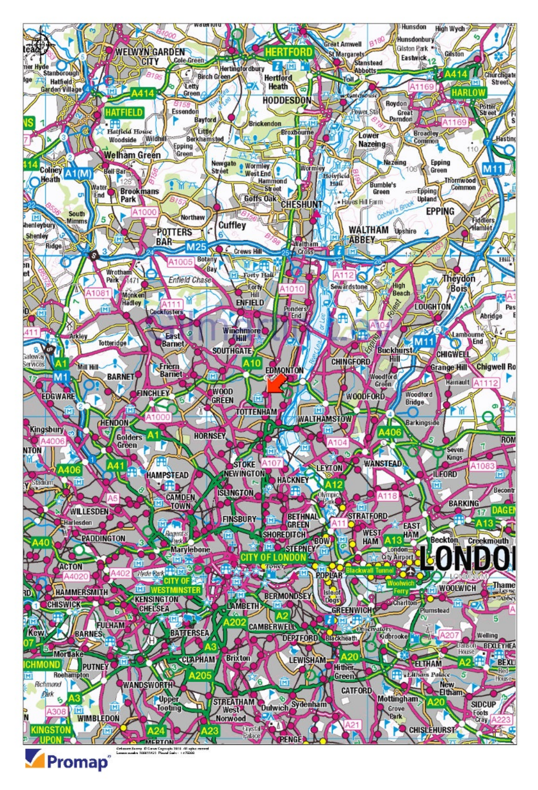
Unit 14 Langhedge Lane Industrial Estate, Langhedge Lane, Edmonton, London N18 2TQ

https://www.gilmartinley.co.uk/properties/to-rent/b8/edmonton/london/n18/25144