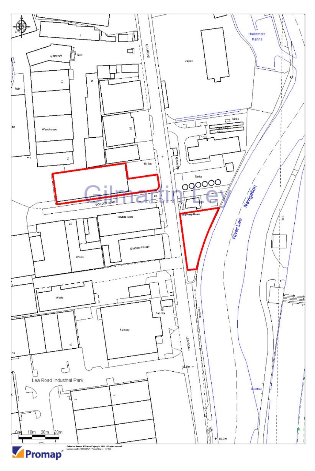
Units 1-10 Gordon Road Waltham Abbey EN9 1AF in addition to the car park diagonally opposite

http://www.gilmartinley.co.uk/properties/to-rent/b8/waltham-abbey/waltham-abbey/en9/24429