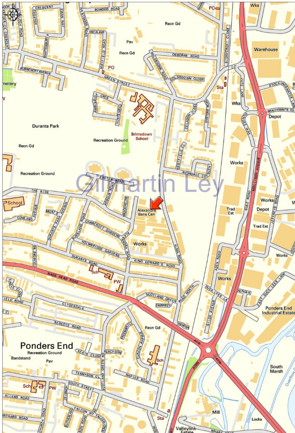
Unit 4 Alexandra Business Centre